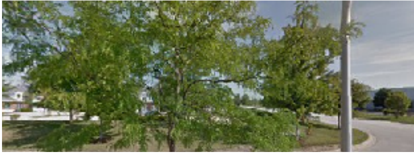
9980 190th St Mokena, IL 60448